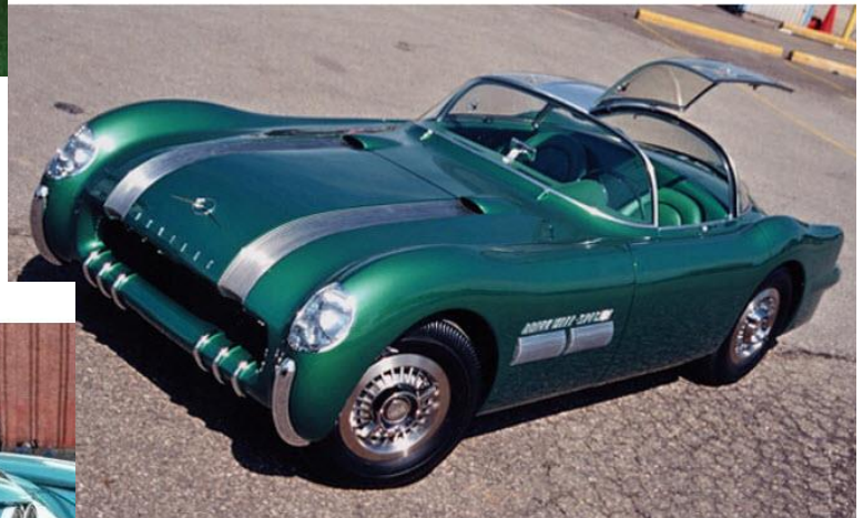
The 1959 Cadillac sports car DeVille Abimelec.

Another GM Motorama concept car designed by famed GM stylist Earl, this 1954 Pontiac Bonneville Special has a 230 horsepower straight 8 with an automatic transmission. It sold for $3.02 million at the Scottsdale 35th Anniversary auction in 2006