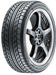
BFGoodrich gForce Real racing heritage. Chosen by Skip Barber Racing Schools