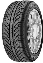
Michelin Pilot Sport A/S Plus True ultra-high performance for all seasons and is covered by a 45,000-mile warranty