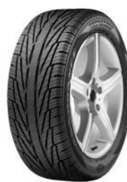
Goodyear Assurance TripleTred All Season Powerful All-Season Traction 80,000 mile tread life limited warranty