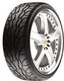
BFGoodrich gForce T/A KDW Real racing heritage. Chosen by Skip Barber Racing Schools